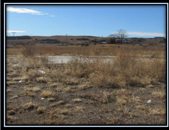
Old Diabetic Building Site